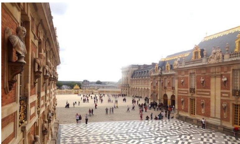
Versailles the iconic palace was built for Louis XIV

When visiting le Vesinet, there are always so many beautiful places to see within a short distance.